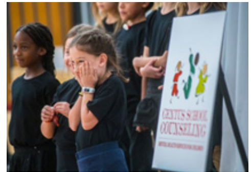
Centus School Counseling for Kids Lunch October 23, 2019